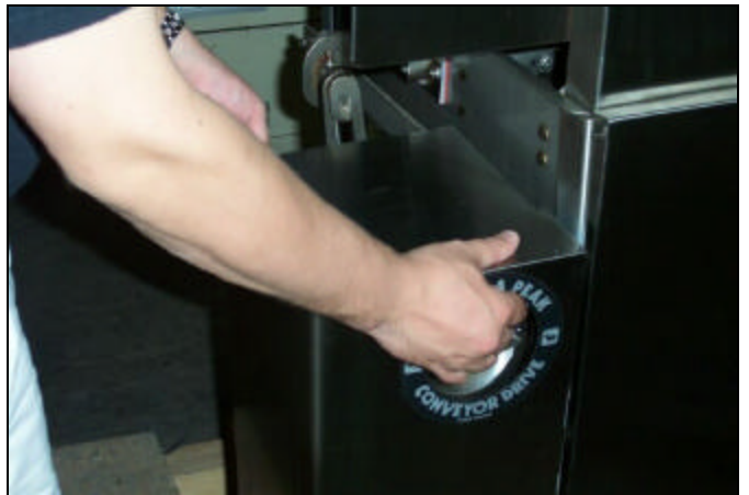
Removing the top cover.

2. Remove the top cover to expose the drive assembly.